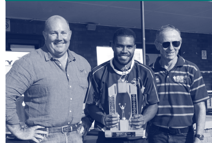
Mons Cup 2017